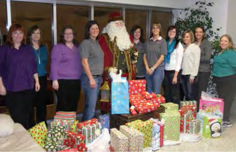
Jr. League of Burlington offers support at the holidays.