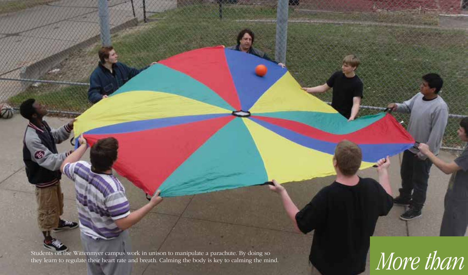
Students on the Wittenmyer campus work in unison to manipulate a parachute. By doing so they learn to regulate their heart rate and breath. Calming the body is key to calming the mind.