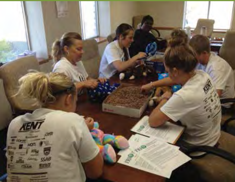
Volunteers in Muscatine help to fill weighted bears. In addition to providing comfort and security, the weight and deep pressure provided by weighted stuffed animals help to calm the central nervous system and bring the child's awareness into the present moment.

4 children die every day as a result of child abuse