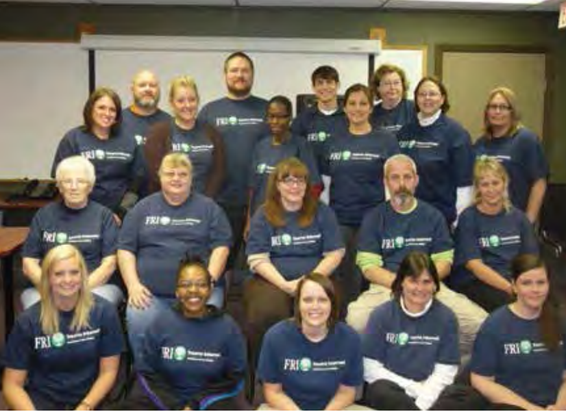
The Family Resources staff receives intensive training on the causes and effects of toxic stress on a developing child as well as the principles of practicing Trauma Informed Care. Over 250 employees have worked hard to complete the full 12 hours of training. Upon completion of all classes employees receive a Family Resources Trauma Informed Care tee shirt.